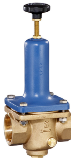
DN 32 - DN 50